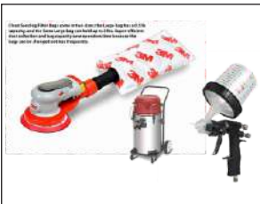
DUST EXTRACTION MACHINE / PAINT SPRAY GUN