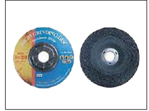
RIGID GRINDING WHEEL