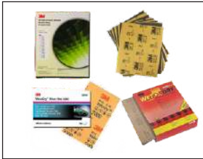
WET / DRY SHEET (POLISH PAPER)