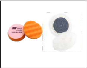
NATURAL WOOL / ORANGE FOAM PAD