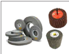
EXL DEBURRING WHEEL