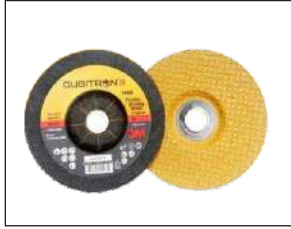
FLEXIBLE GRINDING CUBITRON II