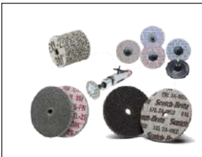
EXL UNITIZED WHEEL