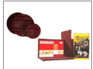
SCOTCH BRITE HAND PAD