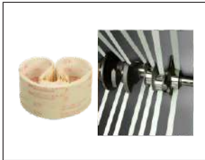
MICRO FINISHING FLIM