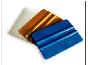
HAND APPLICATOR VINYL WRAP