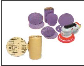
VELCRO / STICKET DISC