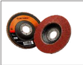
RADIAL FLAP DISK 967A