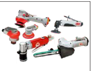
BELT SANDER / NIB SANDER/ MINI RANDOM ORBITALS SANDER