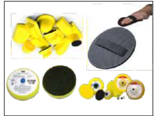
VELCRO / PSA BACKUP PAD