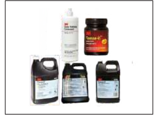
POLISHING COMPOUND (PASTE)/ GLASS POLISHING COMPOUND