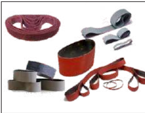
SCOTCH BRITE / TRIZACT/ CUBITRON / ZIRCON BELTS