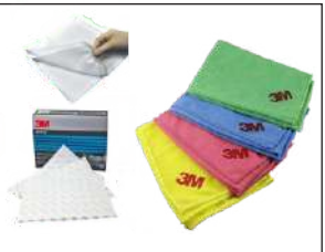
FIBRE CLOTH / TAG RAG / LINT FREE WIPE