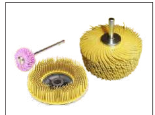
SCOTCH BRITE RADIAL BRISTLE DISK