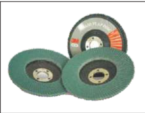
FLAP DISK 563D