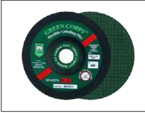
FLEXIBLE GREEN CORP