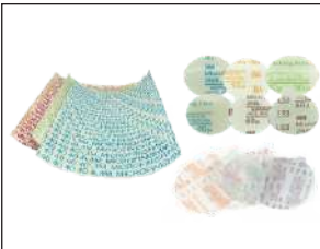
MICRO FINISHING DISC